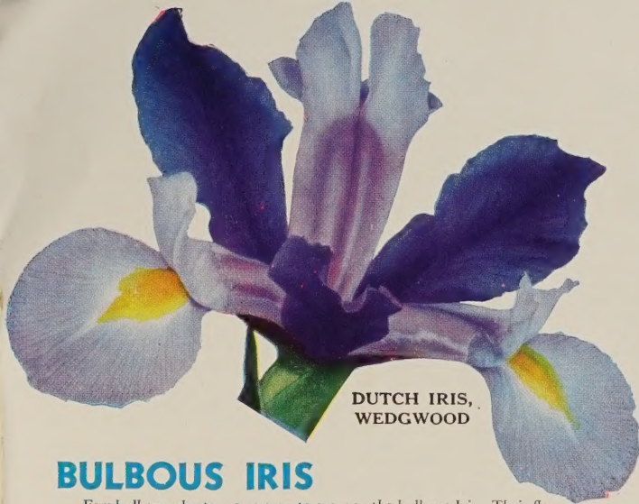
DUTCH IRIS, WEDGWOOD